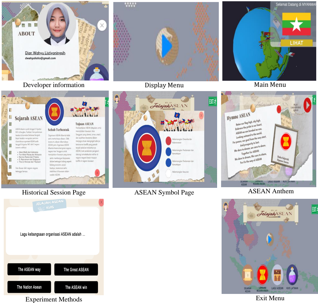
Figure 2. Interface design of JELAS application

The feasibility of the designed media was validated by media experts and refined based on field issues. The ASEAN exploration application media for 6th-grade students was validated by the experts that assessed the media guidebook for its content. After validation, the ASEAN Exploration Application media was used in social studies learning. The effectiveness of the media was assessed using the Gain test and the independent samples t-test between control and experimental groups. The control group at SDN 2 Mrayun did not use the ASEAN Exploration Application, while SDN Jinanten served as the experimental group using the application.