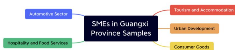
Figure 3. SMEs in Guangxi Province Samples

The study focuses on five SMEs in Guangxi Province, selected to ensure diversity across industries, business sizes, and geographic locations within the region. The sample includes: